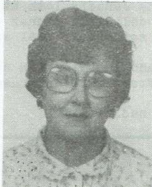
CALL FLO RUTLAND YOUR HOME TOWN INSURANCE FRIEND 753-3255