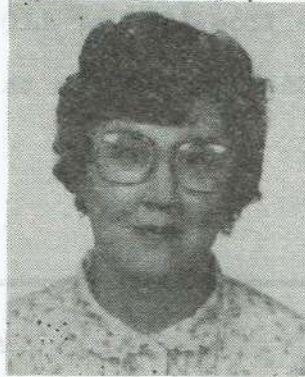
CALL FLO RUTLAND YOUR HOME TOWN INSURANCE FRIEND 753-3255