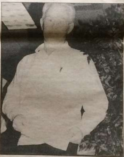
Just a few of the winners