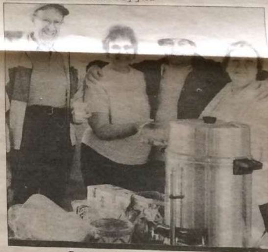
Part of "the crew"