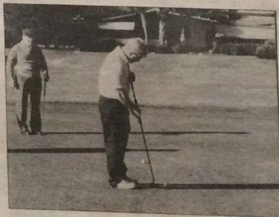
What kind of putter?