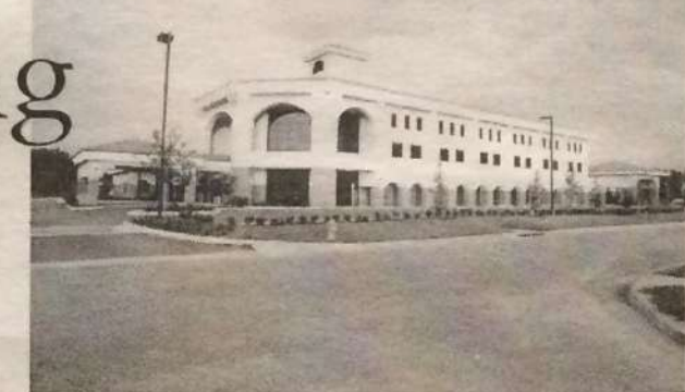
LRMC Outpatient Surgery Center, Lady Lake

Our Surgery Center has something no other facility in the area has...35 years of experience and the full resources of one of the nation's top 100 hospitals behind it.