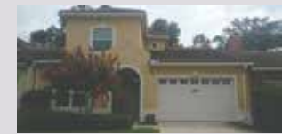
Long Term Furnished Townhome, Spanish Springs 1053 Avenida Sonoma, 3b/2.5b $2000/month Available Immediately