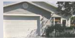
Long Term Unfurnished Patio Villa, Village of Alhambra 1701 Picasso Place, 2b/2b pet-friendly, $1400/month Available Immediately

Please call our Property Management Team at 352-753-7500 ext. 100 to make one of these your next HOME!