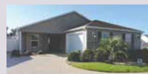
Long Term Unfurnished Courtyard Villa, Village of Lake Deaton 1994 Carrotwood Street, 3b/2b $1500/month Available Immediately