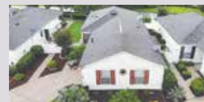
Long Term Unfurnished Courtyard Villa, Village of Piedmont 8485 SE Tremont Street, 3b/2b, pet friendly, golf cart, $1750/month Available Immediately