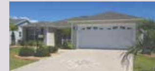
Long Term Unfurnished Designer, Village of Charlotte 3389 Greenacres Terrace 3b/2b, $1550/month Available Immediately