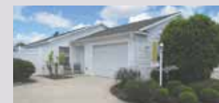
Seasonal or Long Term Furnished Courtyard Villa, Village of Bonita 2214 Pilar Place, 2b/2b $3500/month Available 3/1/2021