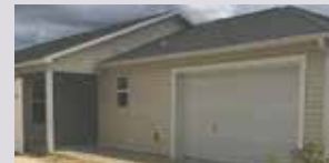
Long Term Unfurnished Courtyard Villa, Village of Lake Deaton 3853 Tufts Terrace, 3b/2b pet-friendly, $1500/month Available Immediately