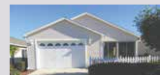
Long Term Unfurnished Patio Villa, Village of Hemingway 1017 Jace Place, 2b/2b $1400/month Available 12/1/2020

LOOK FOR OUR THURSDAY & SATURDAY ADS IN THE DAILY SUN