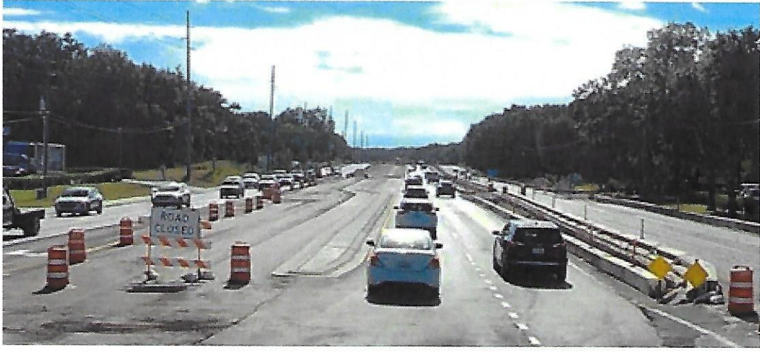
Ongoing Construction along the U.S. 441 and Griffin View Drive Intersection. Improvements include median access and landscaping.

SEE REVERSE SIDE FOR ADDITIONAL INFORMATION